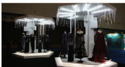
大型靜態展示裝置 (天津) Large Scale Static Display (Tianjin)