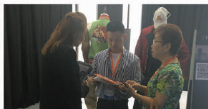
中心同事向客戶介紹是次參展的澳門品牌 (福州) CPTTM personnel introducing Macao labels to visitors (Fuzhou)