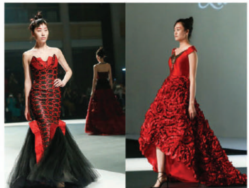
品牌 / Fashion Label: La Mode Désir 設計師 / Designer: 吳嫻嫻 / Kitty Ng (澳門 / Macao)