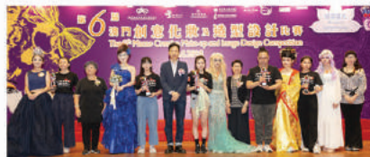
「媒體化妝」頒獎嘉賓、得獎者及模特兒大合照 Group photo of prize award guests, winners, and models of the "Media Make-up"