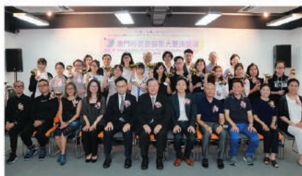
出席嘉賓與得獎者大合照留念 Group Photo with Honorable Guests and Winners

本屆比賽共收到190份參賽作品，當中公開組有67份，學生組則有來自本澳16間學校共123份作品。一眾專業評審從整體美觀性、色彩運用、貼合主題、創意時尚及服裝實用性主要方面作出的評分，為本屆大賽評定各個獎項的誕生。