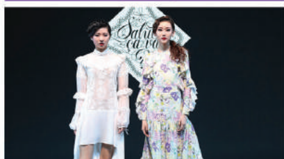
澳門時尚匯演 (福州) Macao Fashion Parade (Fuzhou)