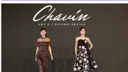
澳門時尚匯演 (天津) Macao Fashion Parade (Tianjin)