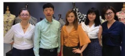
導師（左二）與穿上親手製作立裁作品的學員合照 Instructor (second from left) and students wearing clothes made from 3D cutting