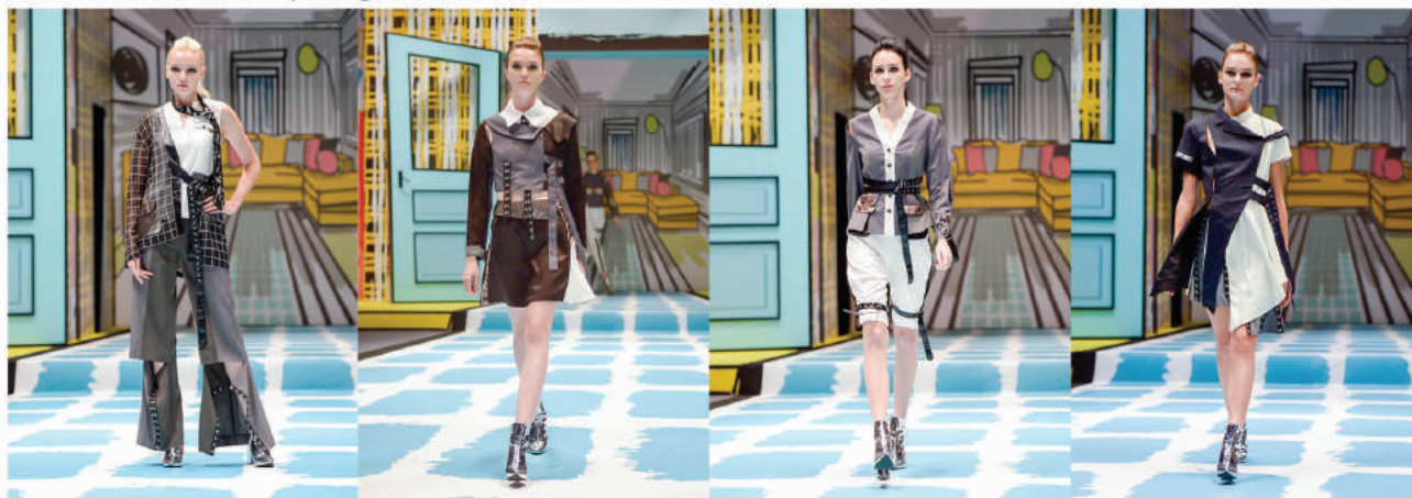
香港服裝節中 MaConsef 的專場時裝表演 The MaConsef Fashion Show at the Hong Kong Fashion Week

「MaConsef 時裝孵化計劃」除了為持續推廣澳門時裝創意產業的發展，使中心每年的『時裝設計及製作文憑課程』畢業學生能學以致用，學習如何開發他們的服飾產品，並親自跟進服裝的生產及成本控制，同時為他們日後成立自身品牌，提供良好的經驗。「MaConsef 時裝孵化計劃」已進行至第 10 年，10 年來共培育了 28 位澳門時裝設計人士，更有部分完成計劃後的組員投身時裝設計行業，成立個人品牌及開設店鋪。