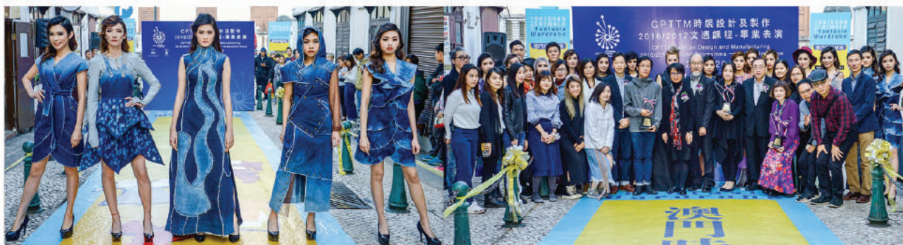
「時裝設計及製作 2016/2017 文憑課程」畢業表演

CPTTM Fashion Design and Manufacturing 2017/2018 Diploma Programme Graduation Show