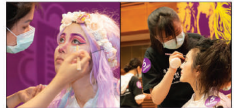
參賽者為模特兒化妝 Competitor putting Make-up on Model

當日同場亦舉辦了「第五屆澳門創意化妝造型攝影比賽」，讓修讀本中心「時裝數碼攝影」學員學以致用，與本澳攝影愛好者相互交流，並為化妝造型比賽記錄了各個精彩時刻。