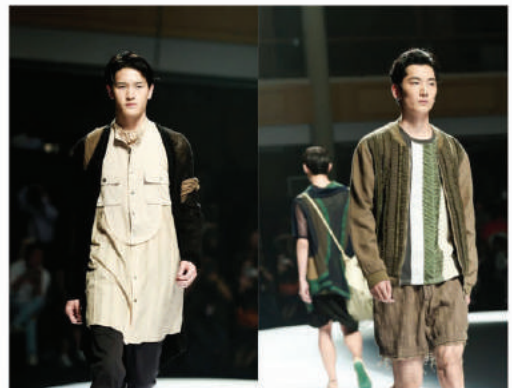
品牌 / Fashion Label: KC GIDEON 設計師 / Designer: 譚筠澤 / Gideon Tam (澳門 / Macao)