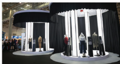
大型靜態展示裝置 (福州) Large Scale Static Display (Fuzhou)

During both stops, the organizer had invited CPTTM to assist them in arranging and organizing fashion shows at the event. A total of six fashion shows were held during the first three days of the events. Many Macao fashion labels showed their collections on the catwalk, giving guests and general public at Fuzhou and Tianjin a taste of the unique charms of Macao fashion and accessories labels. At the same time, the events created lots of business opportunities for the above mentioned fashion labels, helping the label owners to gain a better understanding of the mainland market.