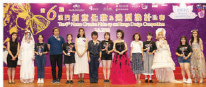
「創意造型設計」頒獎嘉賓、得獎者及模特兒大合照 Group photo of prize award guests, winners, and models of the "Creative Make-up and Image Design"