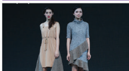
澳門時尚匯演 (福州) Macao Fashion Parade (Fuzhou)