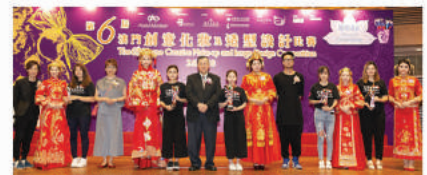
「中式新娘化妝」頒獎嘉賓、得獎者及模特兒大合照 Group photo of prize award guests, winners, and models of the "Chinese Bridal Make-up"