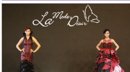
澳門時尚匯演 (天津) Macao Fashion Parade (Tianjin)