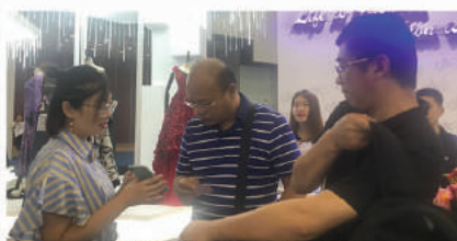
設計師向客戶介紹品牌 (天津) Designer introducing her fashion label to visitors (Tianjin)