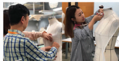
上課情況 Students and Instructor in class

The key feature of haute couture is its exquisite and excellent tailoring skills. Comparing to bulk produced fashion from factory assembly lines, haute couture put attention into every minute detail. In order to further promote the professional tailoring skills of Macao fashion production people, CPTM organized a "European-Style 3D Modeling Course" in March. The latest European cutting skills are introduced to students, focusing on using the correct method to directly cut a garment from a human body model according to the styles and effect requested by the designer. Under the guidance of the instructor, students learned the various techniques of European 3D cutting as well as production process of haute couture fashion, improving on both their pattern-cutting and tailoring skills.