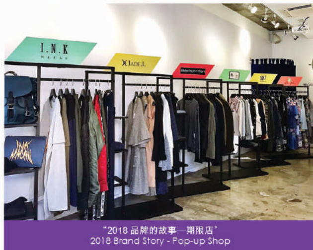
“2018 品牌的故事—一期限店” 2018 Brand Story - Pop-up Shop