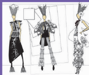
亞軍 - 張讀輝 «Platonic» First Runner-up - Cheong Chan Fai «Platonic»